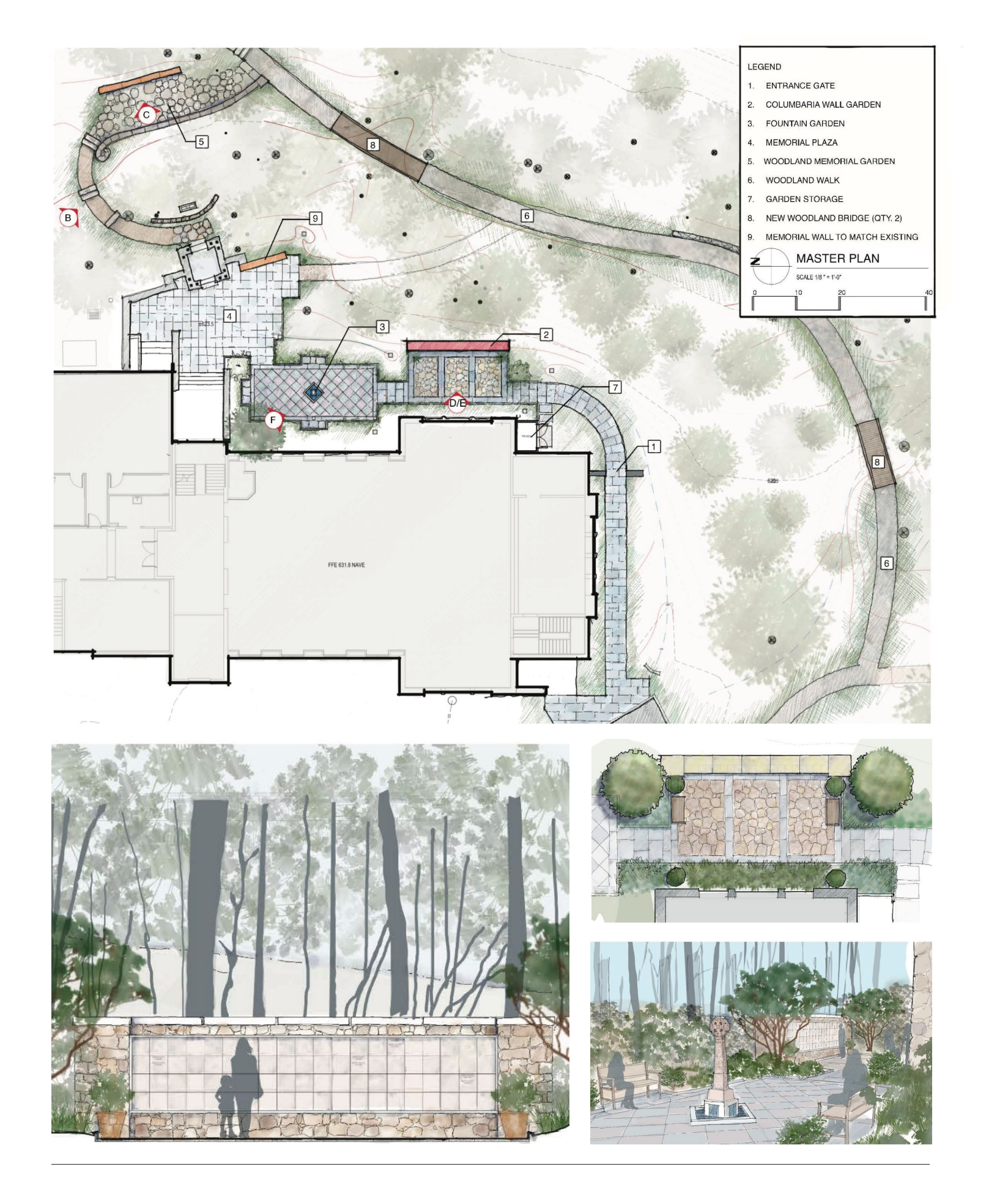
(Photos) Plans and renderings by Golightly Landscape Architecture offer a glimpse of the expanded Memorial Garden, including a new columbarium and water feature nestled among the beauty of the church's woodland setting.

"And if I go and prepare a place for you, I will come again and will take you to myself, so that where I am, there you may be also." JOHN 14:3